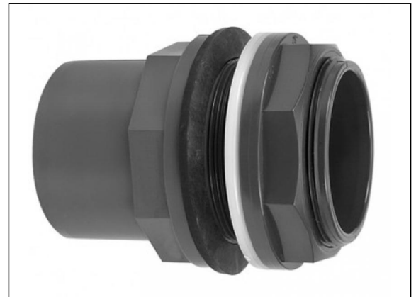
8.08 PP slipping